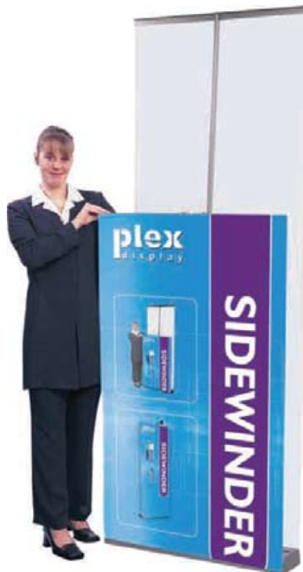
Sidewinder Double-Sided Unit